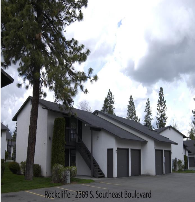
Rockcliffe - 2389 S. Southeast Boulevard